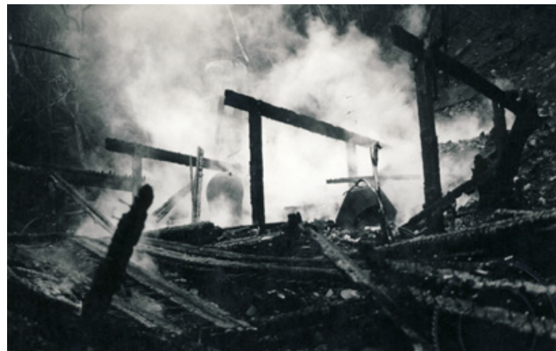
Fire at Van Gend house in the 1990's.

It's primary objectives seek to empower local communities in assisting them to become more aware of the risks of fire and capacitate them to act proactively to reduce the hazards and vulnerability of assets. It also empowers members to act as a first response to fire emergencies. In so doing, communities become safer and are more prepared in the event of a fire emergency. Through the creation of an enabling framework and greater awareness, fewer ignitions will result in less spread and easier suppression of veld fires.