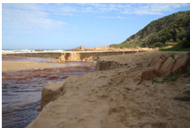
May 8 , 2011

Between 6th – 8th May we had 113mm. This caused the river to wash out across the beach. It was very dramatic as the river gushed in front of Montrose, took the bend at Knarr and entered the sea somewhere between North cottage and Craigross. Vehicular access was impossible. Within 2 weeks of that, high winds had brought the sand back and access has been re established. See the photos.