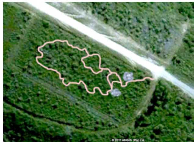
Path plan of School site.