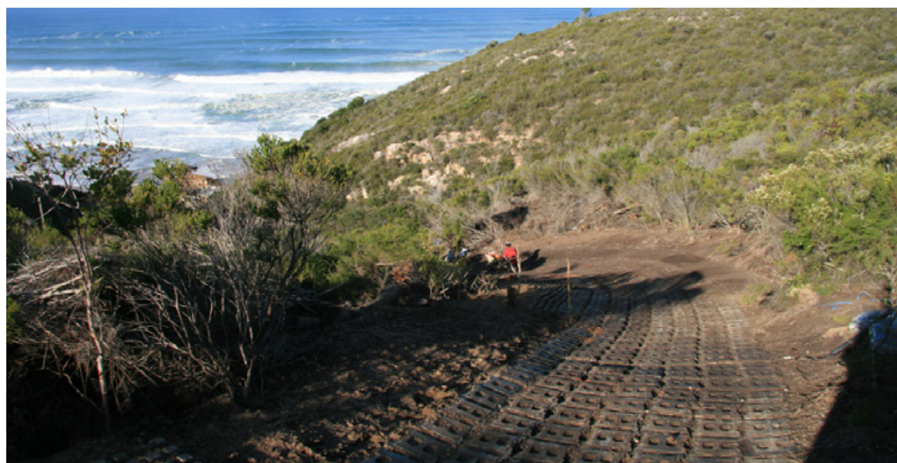
Dons road as of June 2011