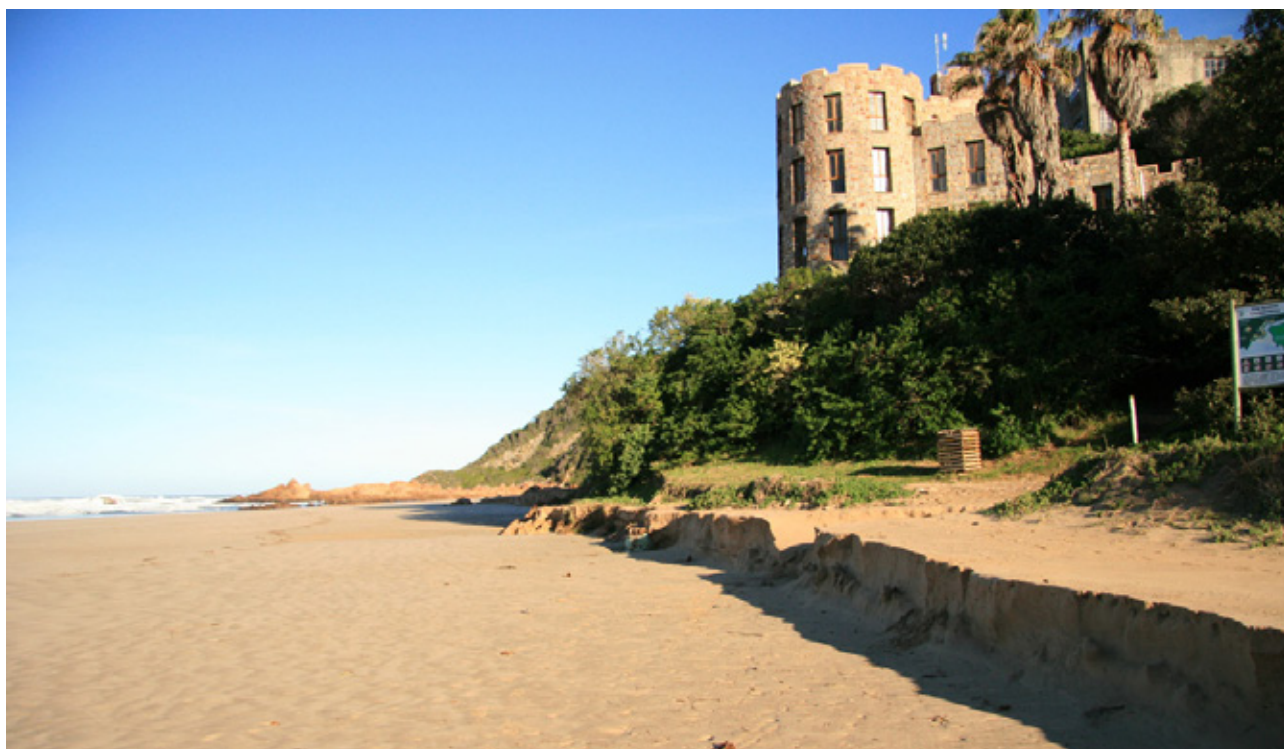
June 2, 2011