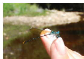
Blue Emperor Dragon fly