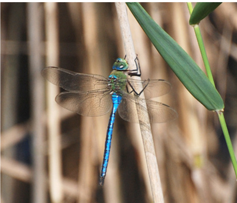
Male Blue Emperor Dragonfly

An interesting website to explore is www.warwicktarboton.co.za