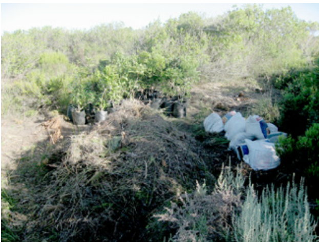
30 trees await planting.