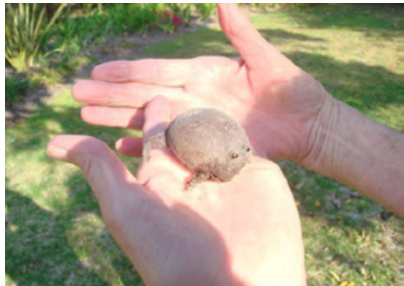
Plain Rain Frog

You lucky people are ideally situated to make photographic recordings of your wild animal life. These studies are in their infancy, for example I'm sure one could indentify by their markings and count individual bushbuck. Why don't the elephant people use stealth cameras? Perhaps they do?