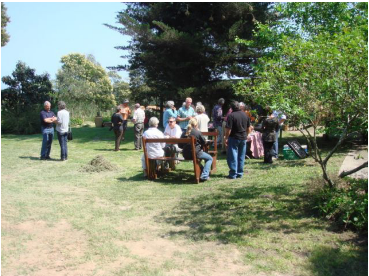
Teatime at Gouna