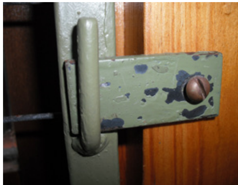
ABOVE: Modified door handles LEFT: Window grid