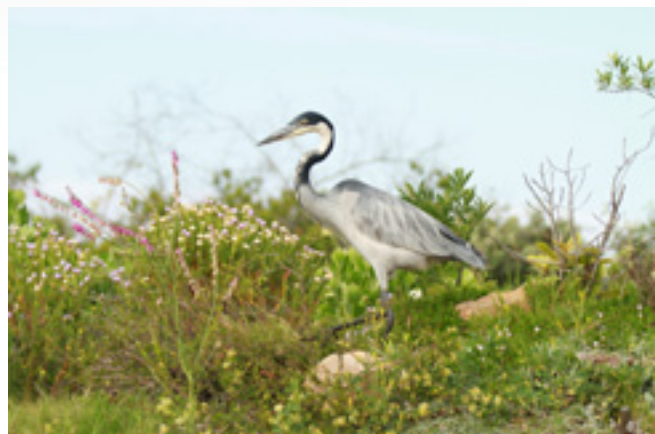
Black Headed Heron by Wendy Dewberry 22 Oct 2011 Noetzie Headland Canon EOS 7D F6.3, 1250 sec, ISO 400

Email photos as JPG preferably 300 dpi. If the files are too big to email, please copy them onto a disc.